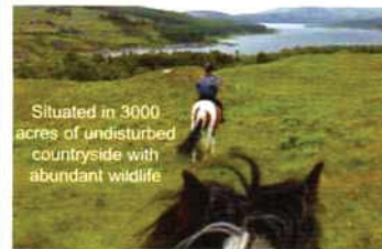
Situated in 3000 acres of undisturbed countryside with abundant wildlife

in spectacular surroundings, bring your own horse or use one of ours to explore the 70 miles of amazing off road hacking that Craigengillan offers.