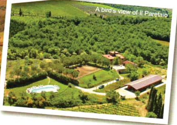
A bird's view of Il Paretaio