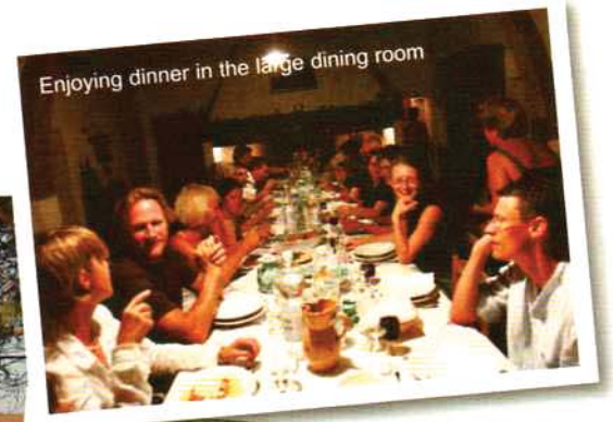
Enjoying dinner in the large dining room