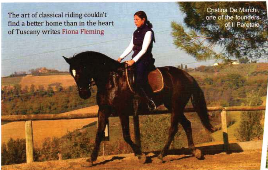
The art of classical riding couldn't find a better home than in the heart of Tuscany writes Fiona Fleming